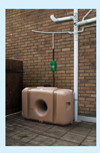
RW700 also compatibale with Ezy-Filter greywater recycling system as seen from the photo left. Refer to Domestic Kingspanwater brochure and the spec sheet on Ezy-Filter for more information.