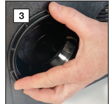
3. Tighten firmly so that the nut and seal do not move.