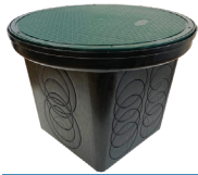
7 Hole Uncut SKU: 3017-207