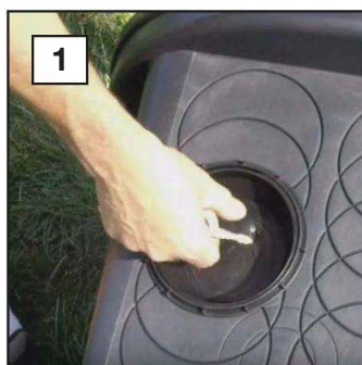
1. To release the pull tabs, use a key or screwdriver to start the pull tab for the correct pipe size. (PULL OUT - DO NOT CUT OUT!)