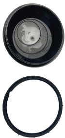
4" Seal and Nut 3001-SN