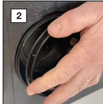
2. Tighten the nut from the outside.