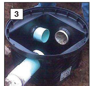
3. You are now ready to insert the correct size pipe by pushing it through the flexible D-Box seal.