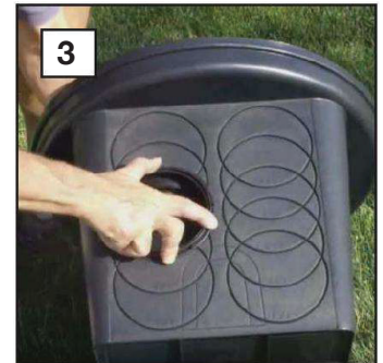
3. Tighten firmly so that the nut and seal do not move.