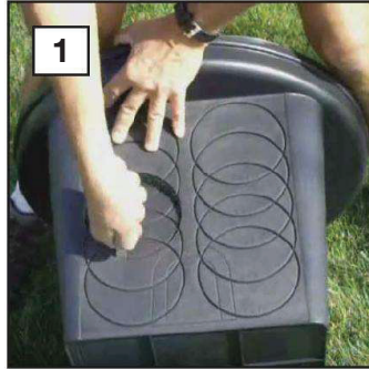
1. Lubricate your blade and cut along the angle of the cut guides.