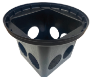
7 Hole PRE-CUT 3017-207-C