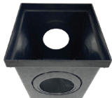
Drainage Box PDB-12KIT(BLACK)

No tools required. All boxes include grates or covers. Follow steps 1-3 below. ( Note: Boxes may arrive with seals pre-installed.)