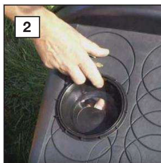
2. Once you have started the tear, use your fingers to pull out the rest of the tab until the hole is complete.