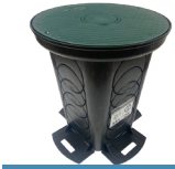
4 Hole D-Box SKU: 3017

Tools needed: A blade no wider than 1/2" and grease or lubricant for the blade. Follow steps 1-3 below.