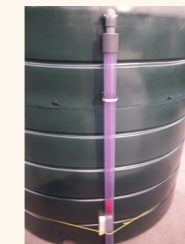
SIGHT LEVEL GAUGE